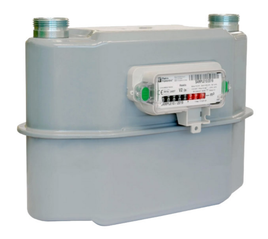
Revision B - Issue 10/2022