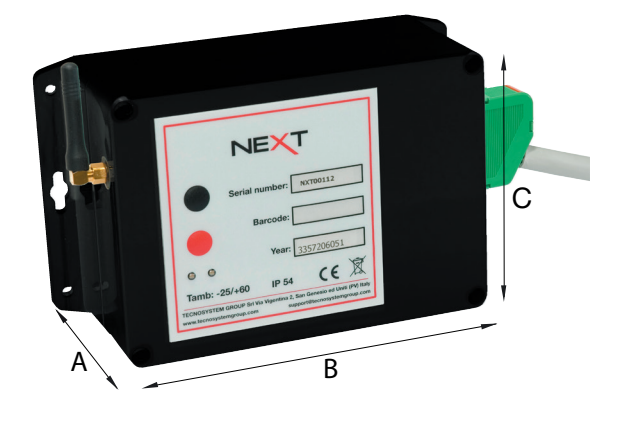
Figure 2 Next dimensions